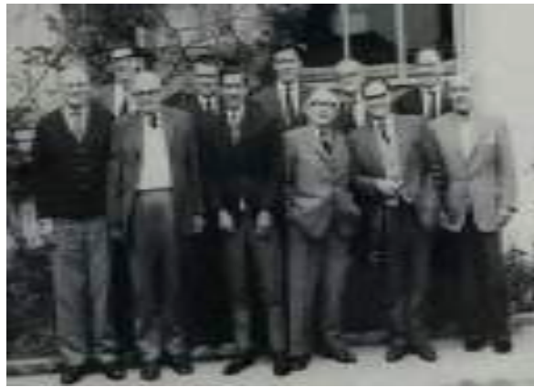
Bristol May 1967