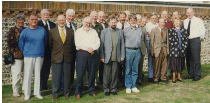
Worthing - Date Unknown