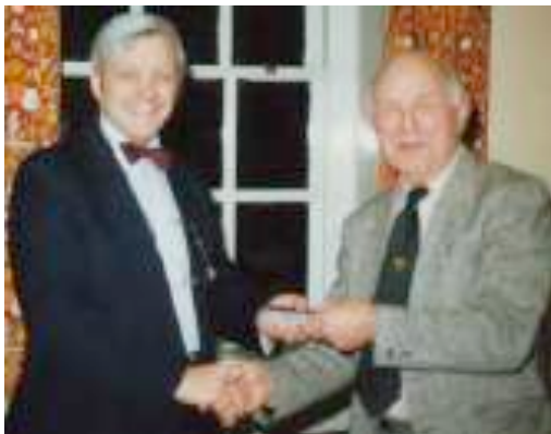
1992 Derek Clayton