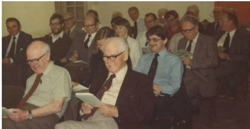
T Trail Kelantan sale June 1984