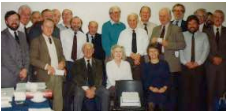
Autumn Auction 1989 – 30 th Anniversary