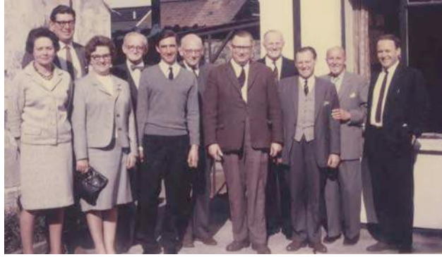
Bristol May 1965