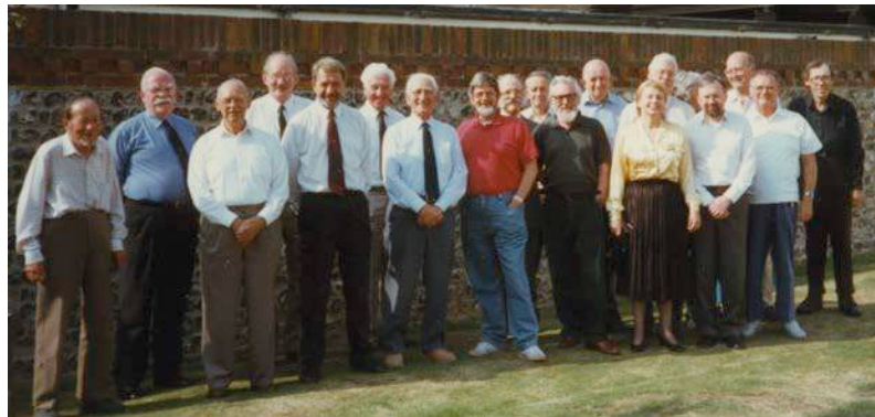
Worthing - Date Unknown