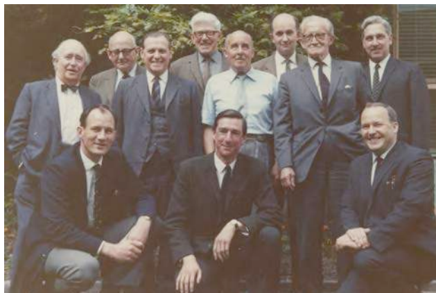
Bristol June 1968